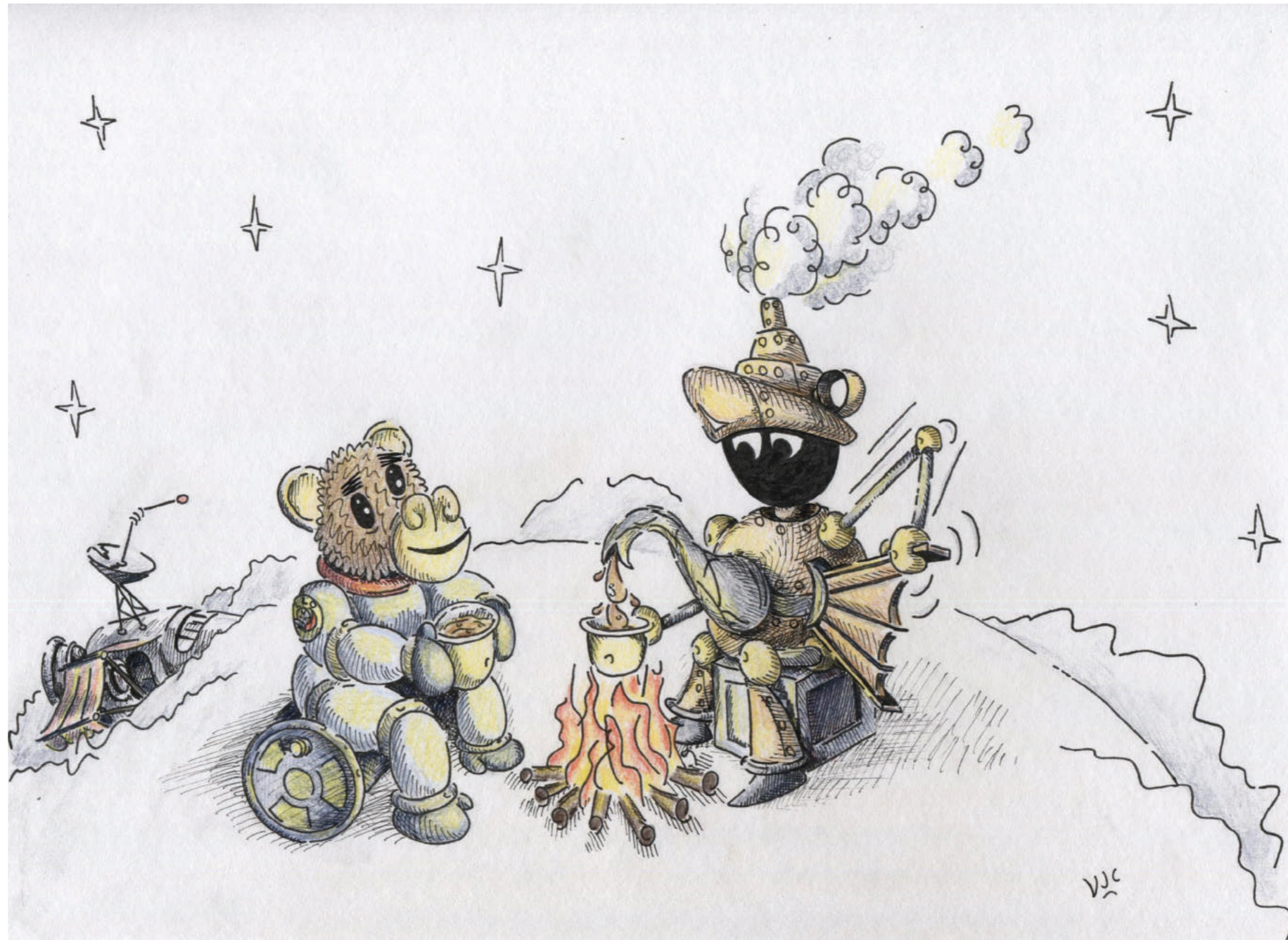
85% of Original Size