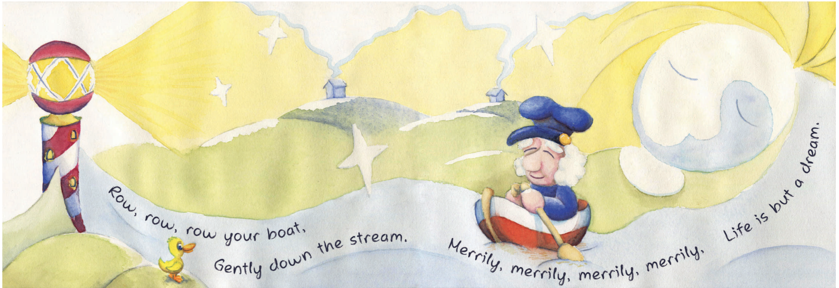
66% of Original Size