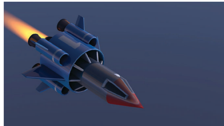
74.5% of Original Size