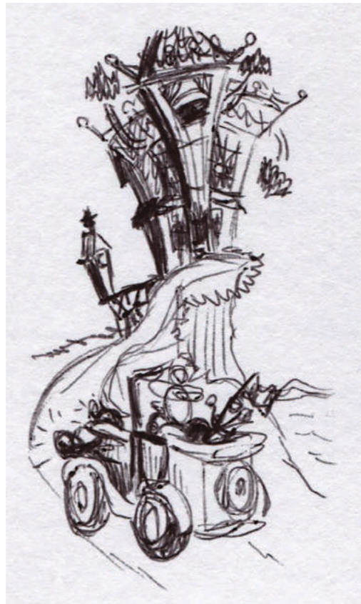
135% of Original Size