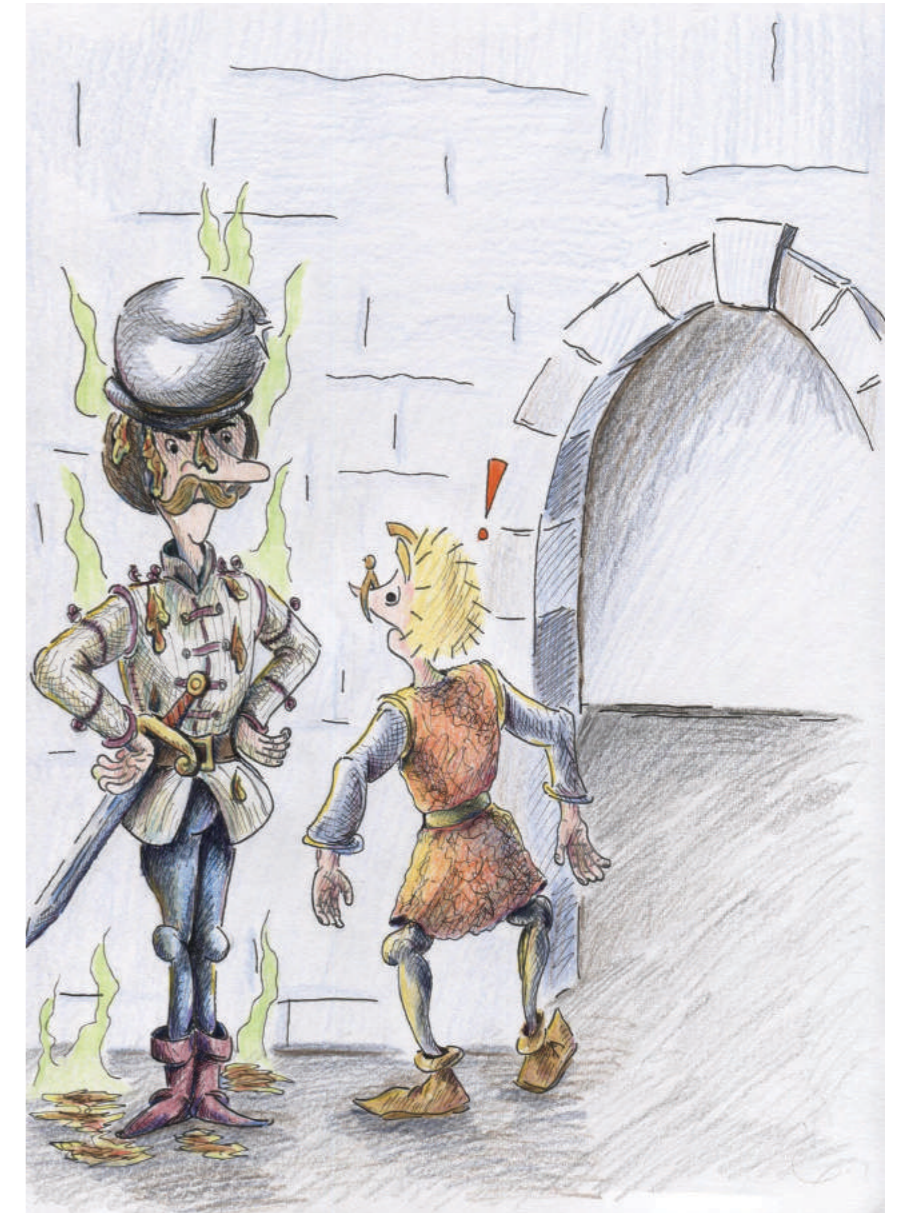
55% of Original Size