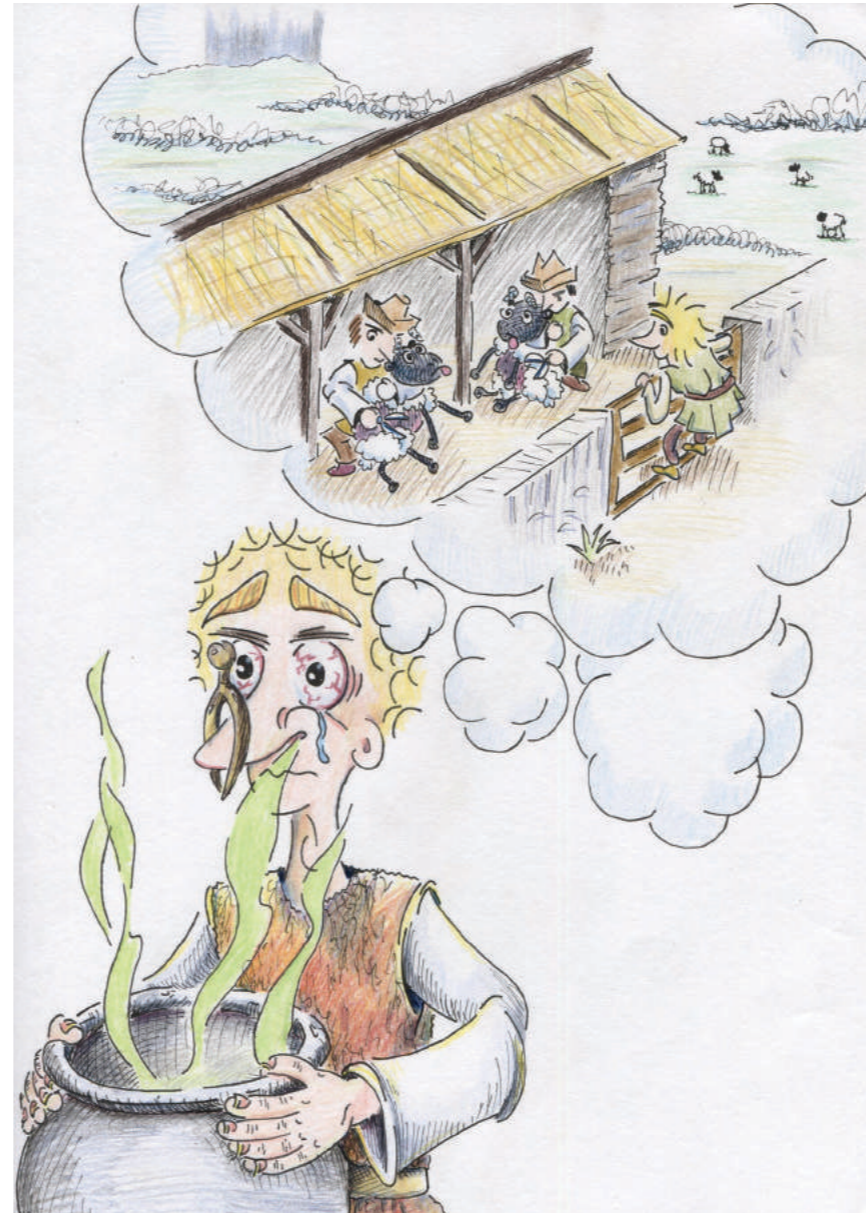
55% of Original Size