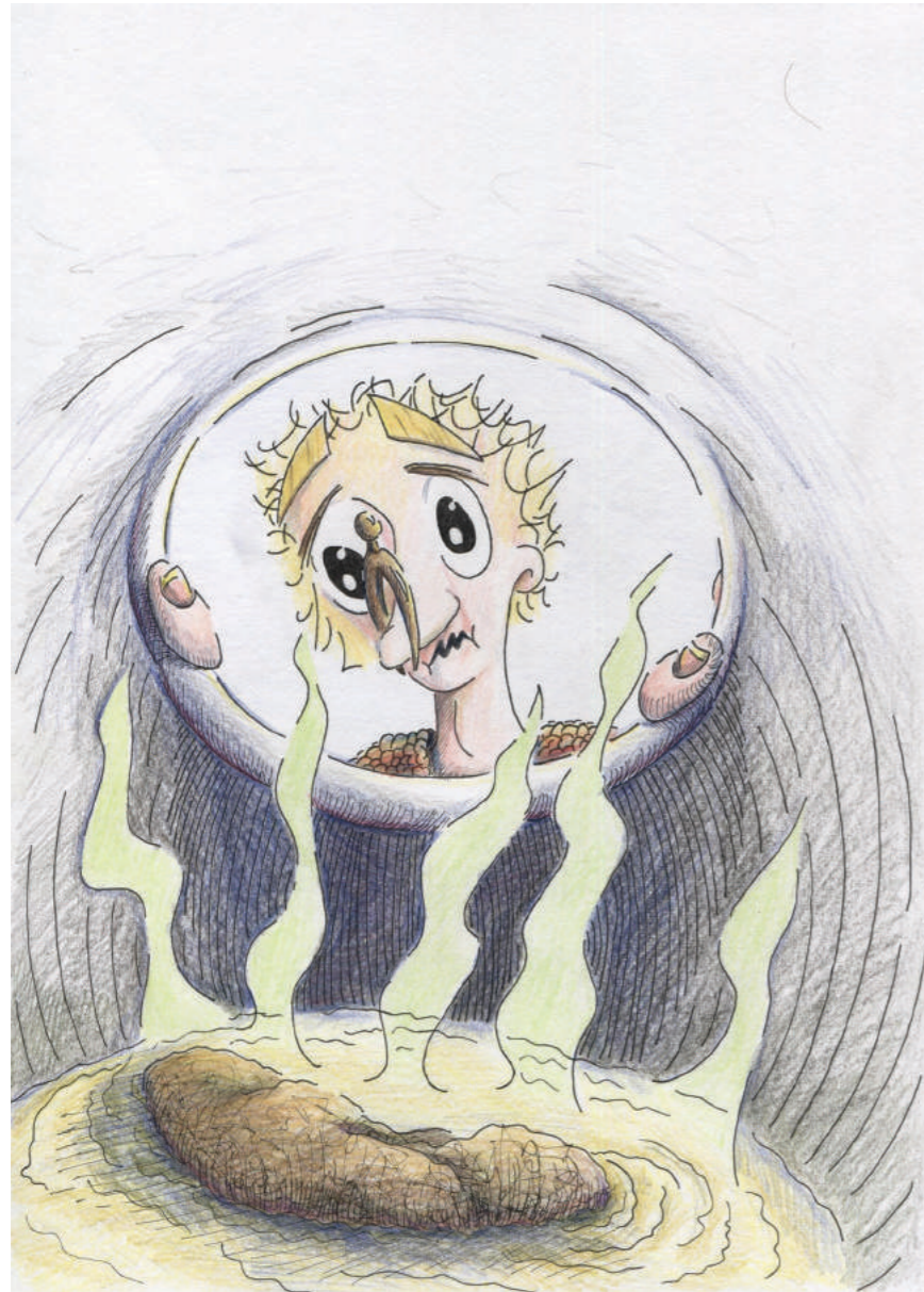
55% of Original Size