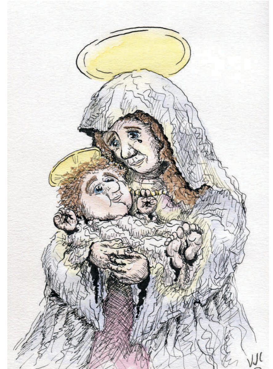
55% of Original Size