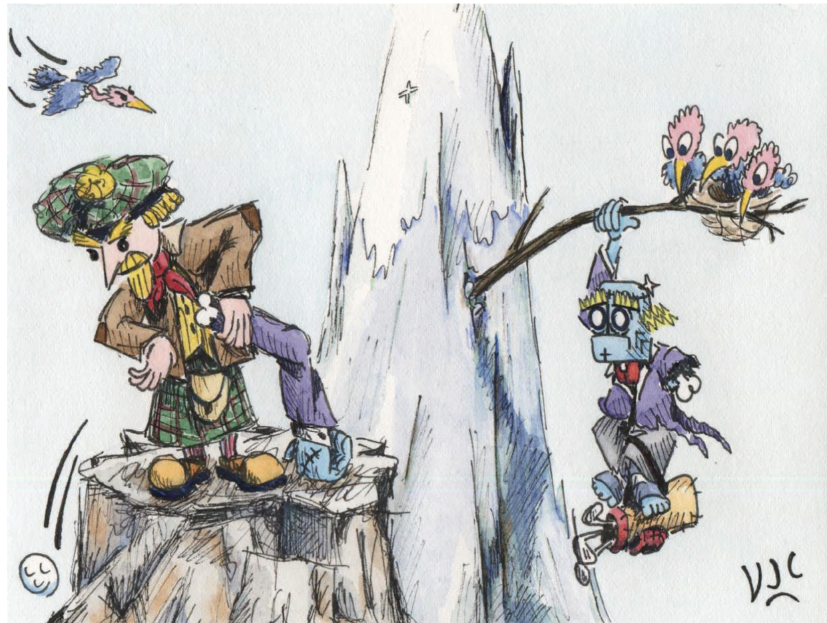
150% of Original Size