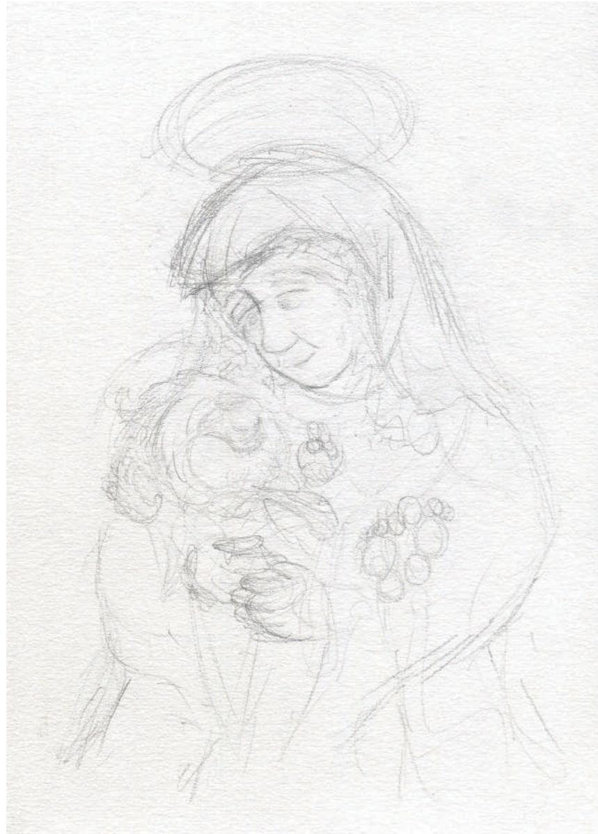
55% of Original Size