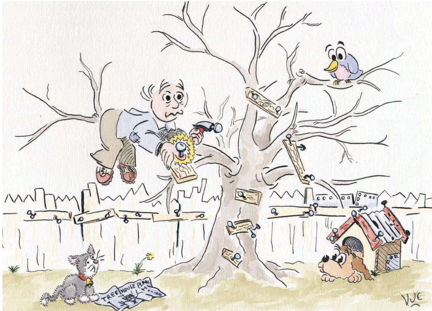
85% of Original Size