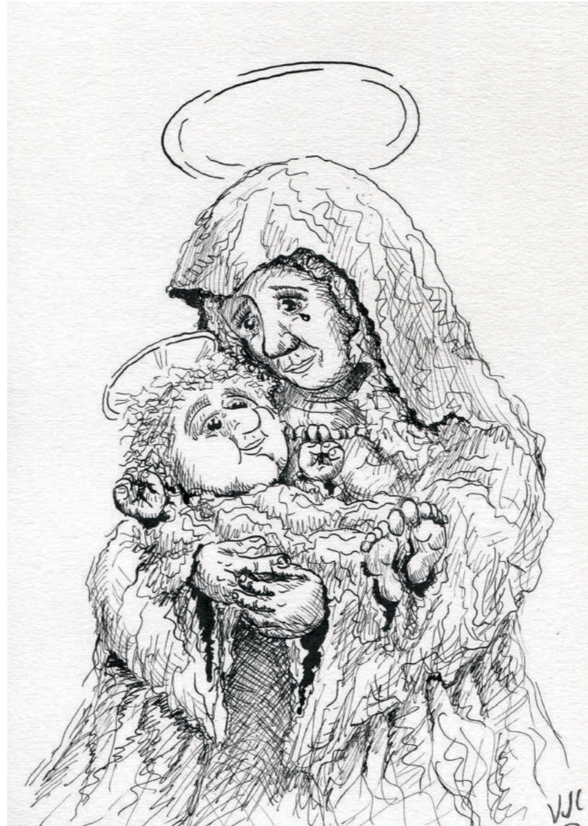
55% of Original Size