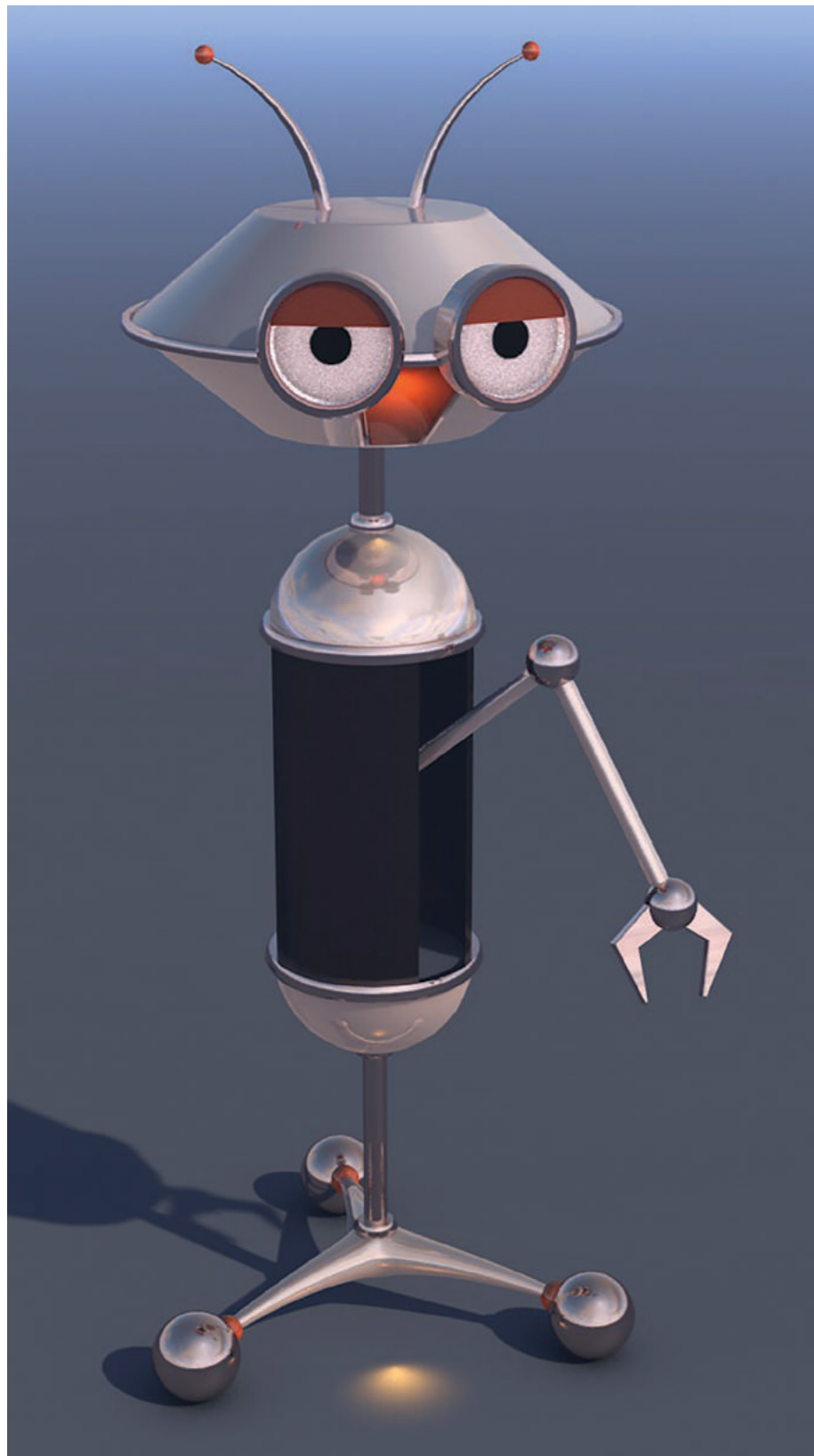
235% of Original Size